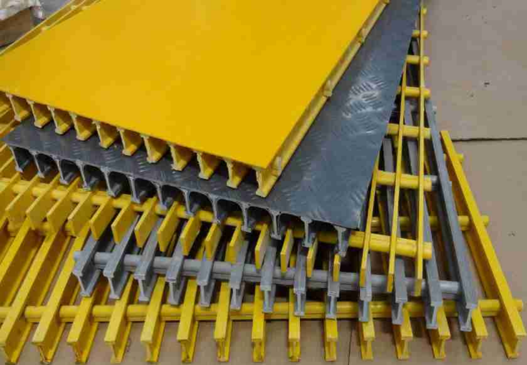
FRP GRATINGS & CHEQUERED PLATE