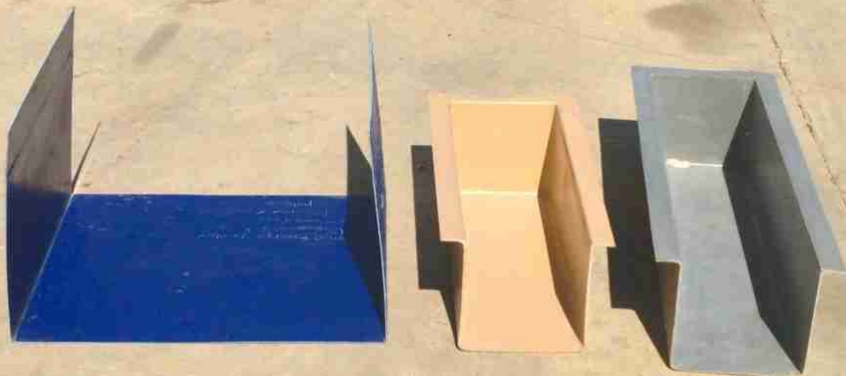
FRP RAIN GUTTER