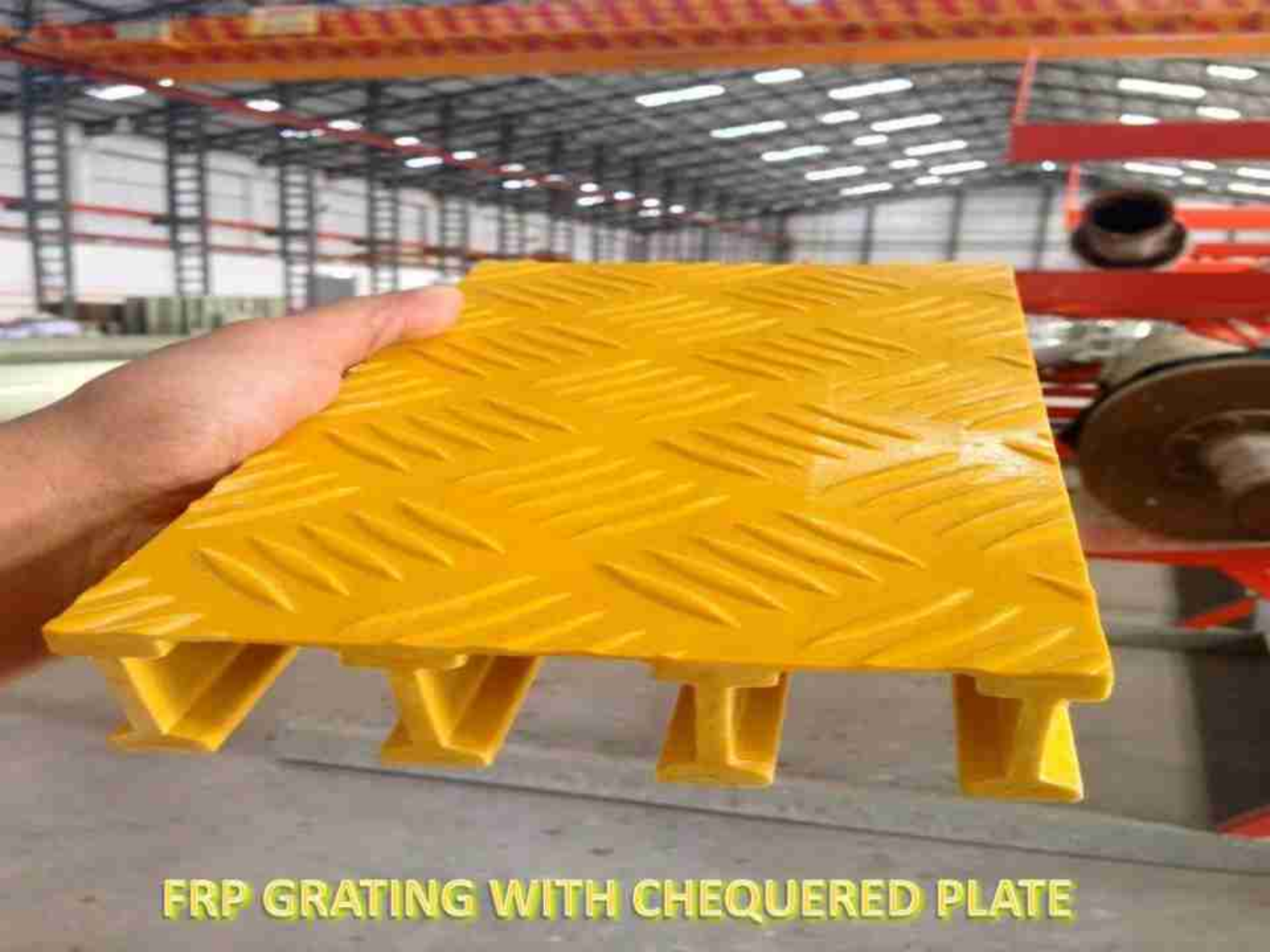
FRP GRATING WITH CHEQUERED PLATE