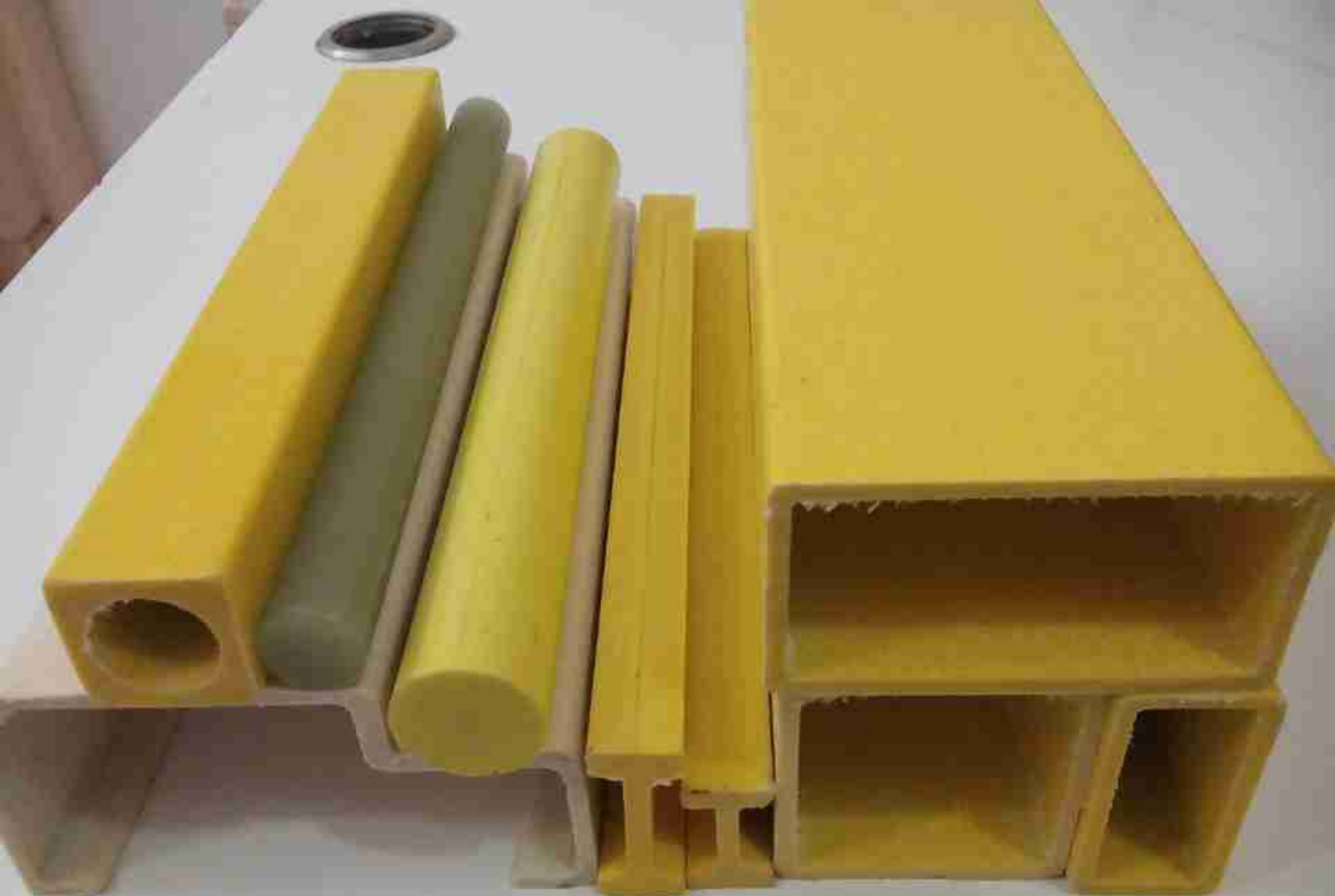
FRP PULTRUDED SECTIONS