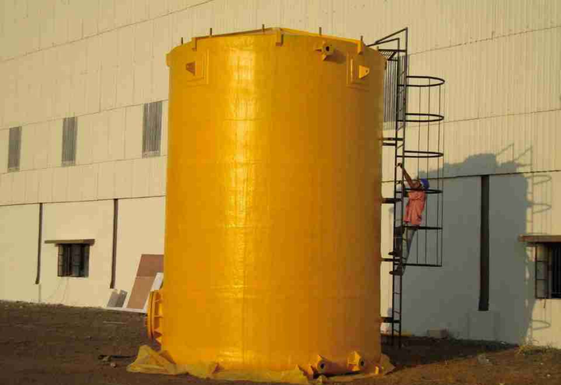
FRP HCL STORAGE TANK