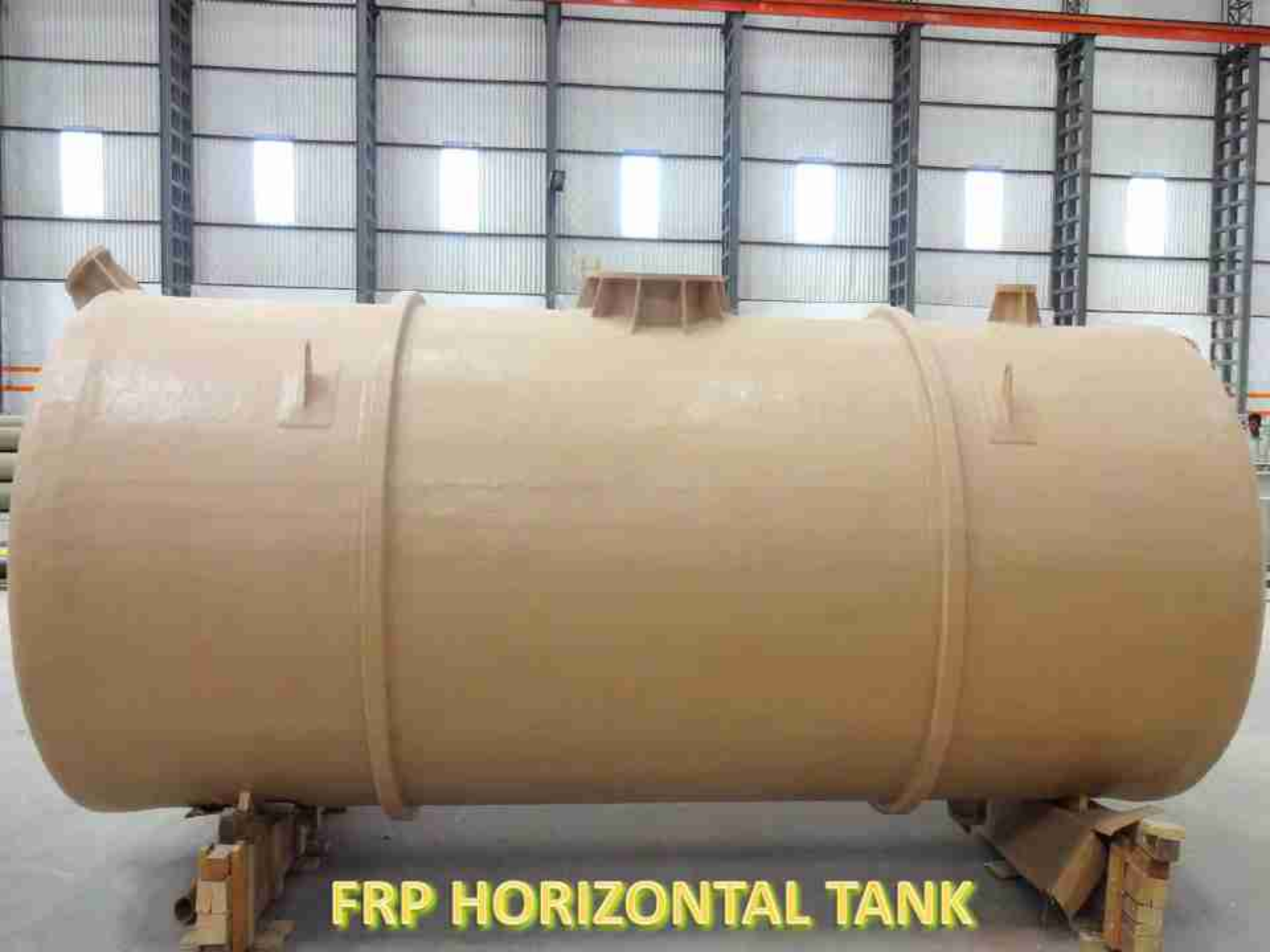
FRP HORIZONTAL TANK