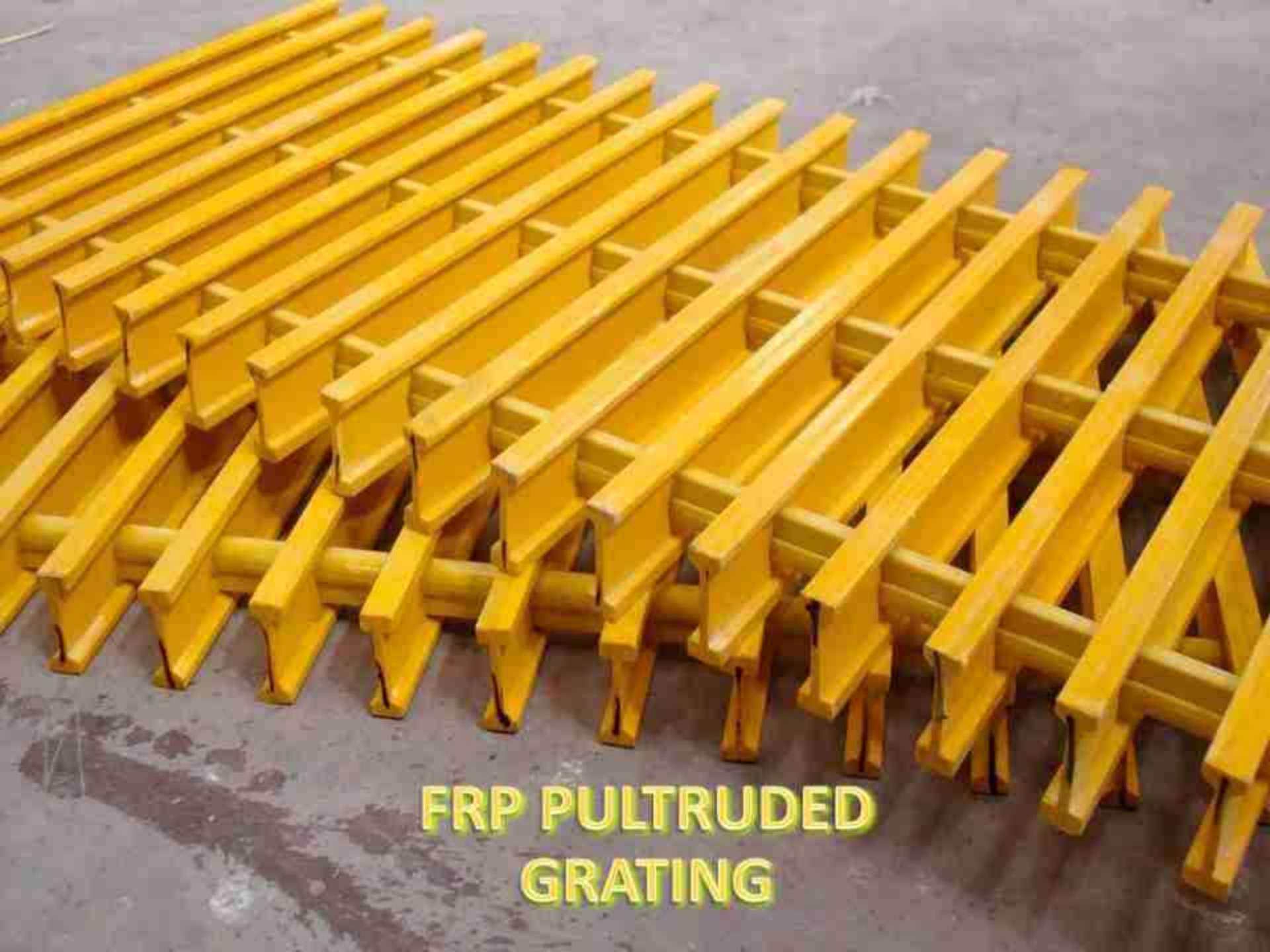
FRP PULTRUDED GRATING